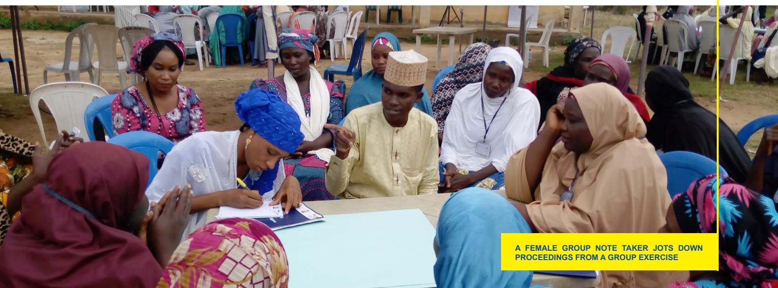
A FEMALE GROUP NOTE TAKER JOTS DOWN PROCEEDINGS FROM A GROUP EXERCISE