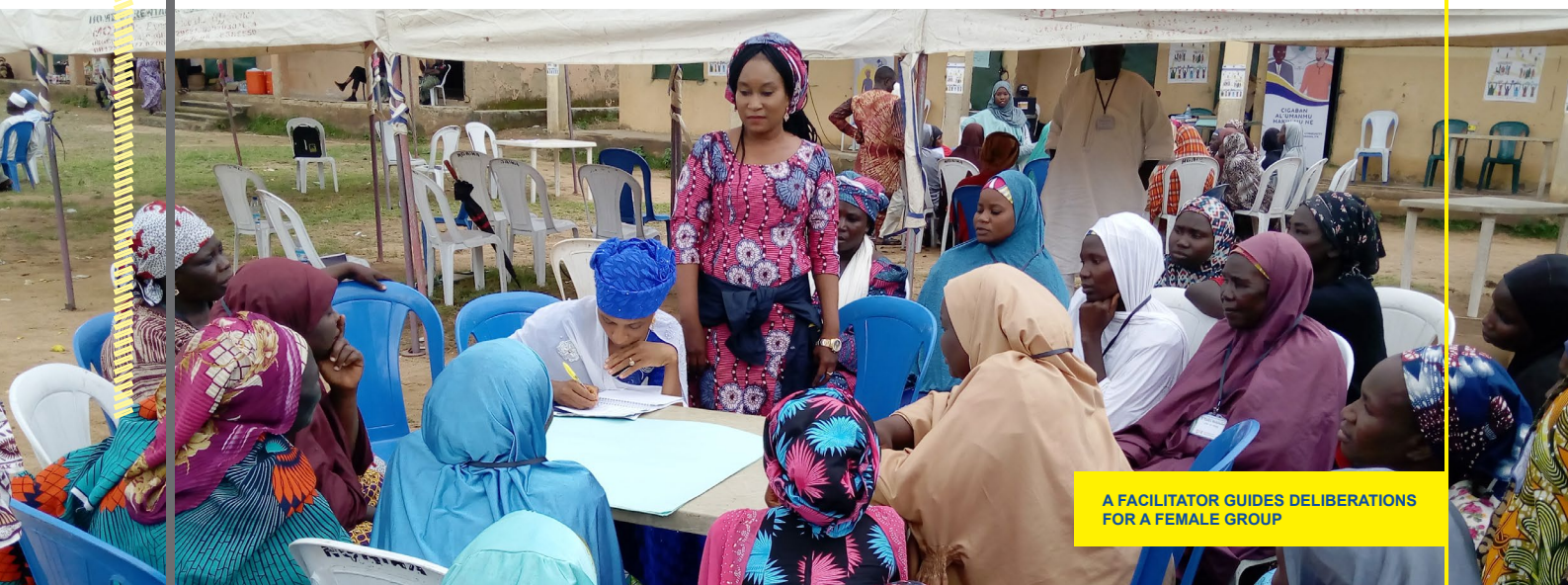
A FACILITATOR GUIDES DELIBERATIONS FOR A FEMALE GROUP