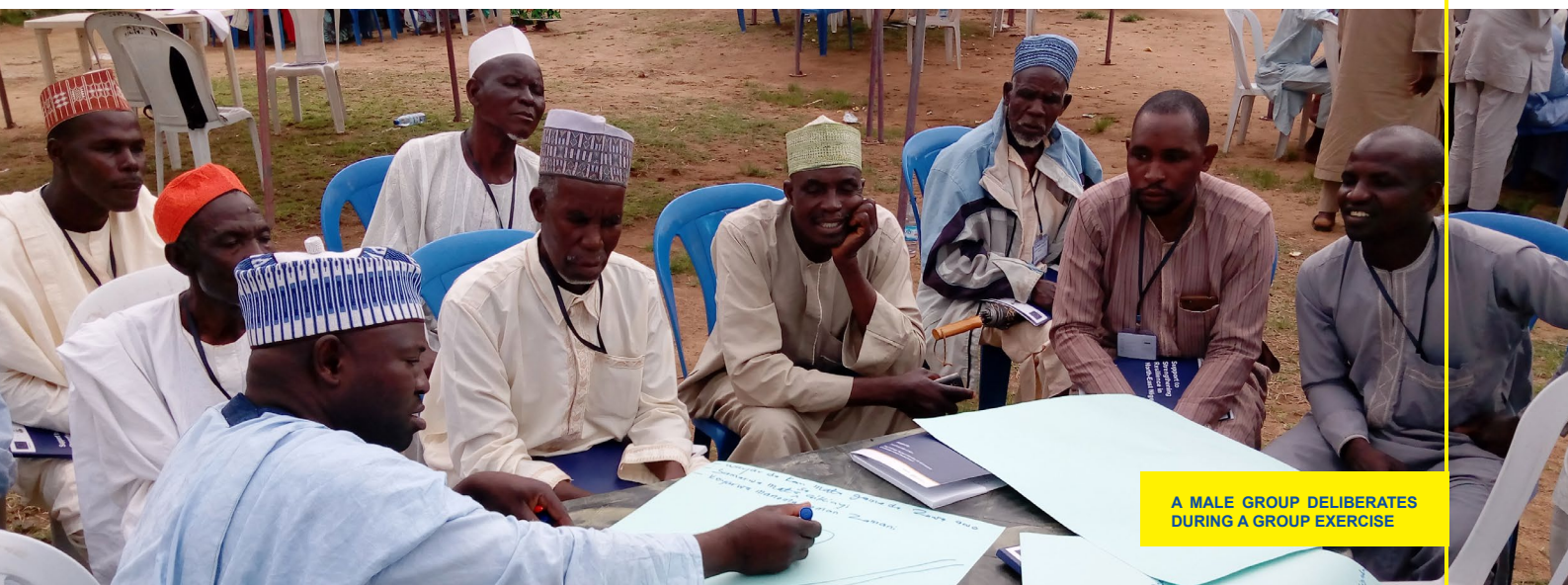
A MALE GROUP DELIBERATES DURING A GROUP EXERCISE

Therefore, I urge the present and future generation to hold on to our cherished values of love unity and hard work, to take formal education seriously as an enduring legacy, to be law-abiding and to be responsible citizens. My profound gratitude to the European Union, the German Federal Ministry for Economic Cooperation and Development for taking an interest and providing resources to educate my people on sustainable development; GIZ for organizing the process and CPPLI the partnering Civil Society Organization (CSO) for facilitating the sessions.