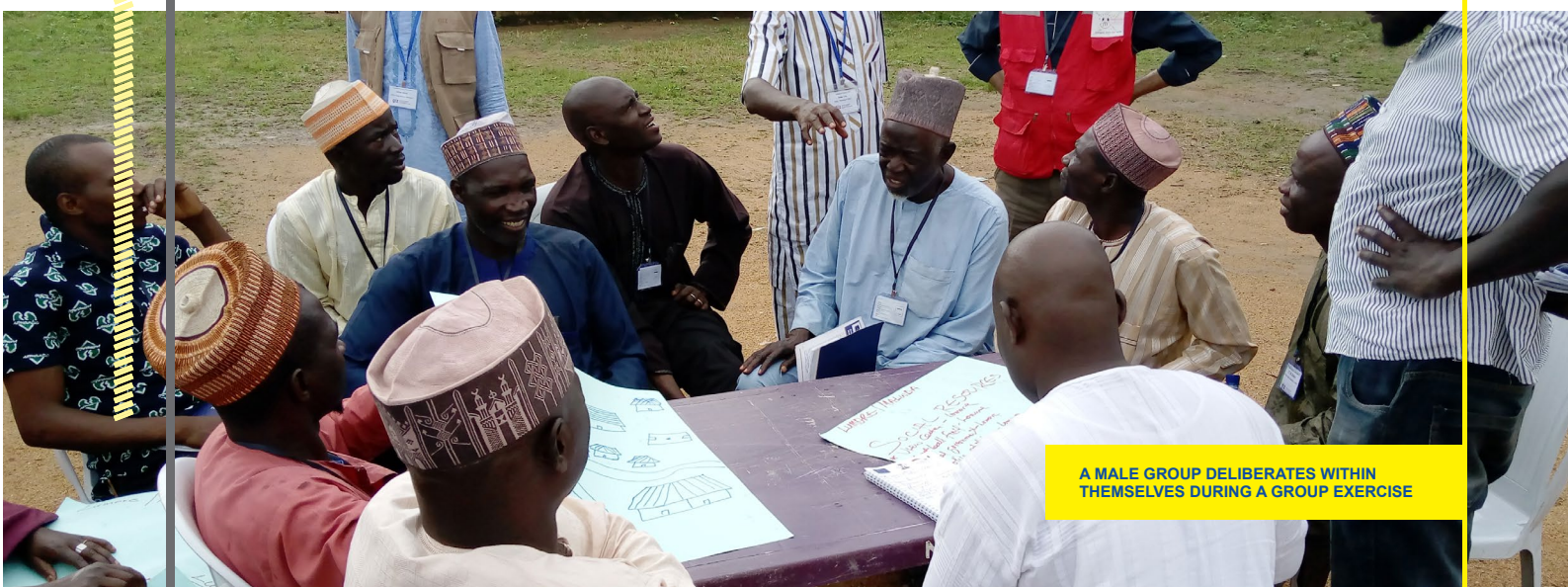
A MALE GROUP DELIBERATES WITHIN THEMSELVES DURING A GROUP EXERCISE