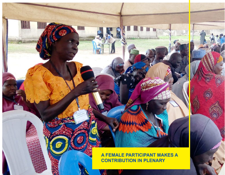
A FEMALE PARTICIPANT MAKES A CONTRIBUTION IN PLENARY