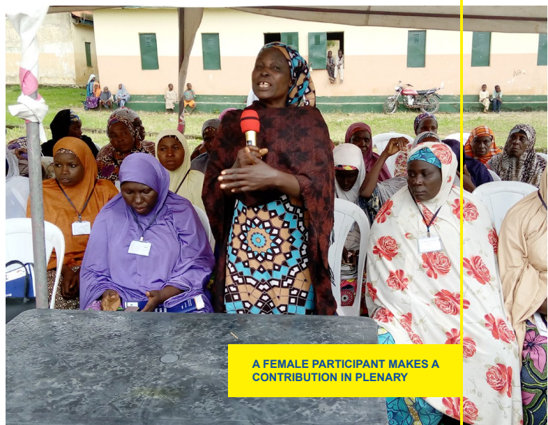
A FEMALE PARTICIPANT MAKES A CONTRIBUTION IN PLENARY

The tangible results of the Gella ward CDP process and especially the CDP session is this Ward Development Plan. The Plan and its content were validated by the representatives of the Gella ward.