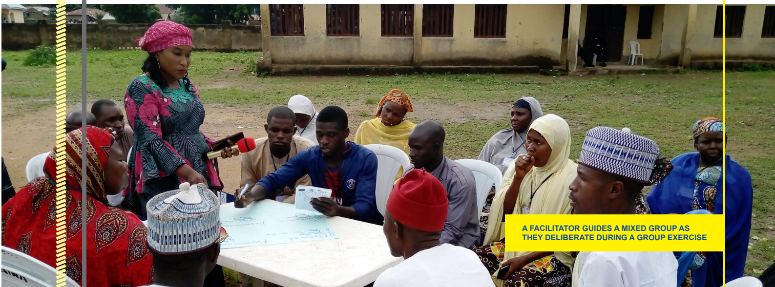
A FACILITATOR GUIDES A MIXED GROUP AS THEY DELIBERATE DURING A GROUP EXERCISE