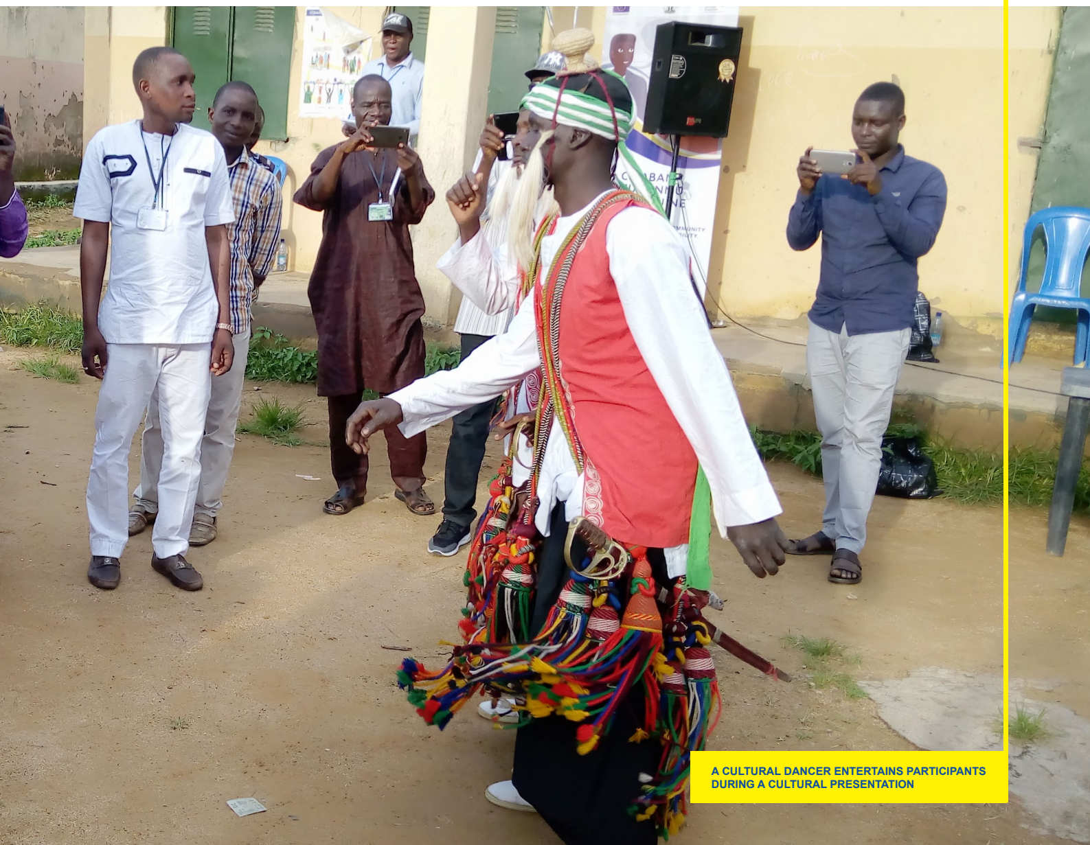
A CULTURAL DANCER ENTERTAINS PARTICIPANTS DURING A CULTURAL PRESENTATION