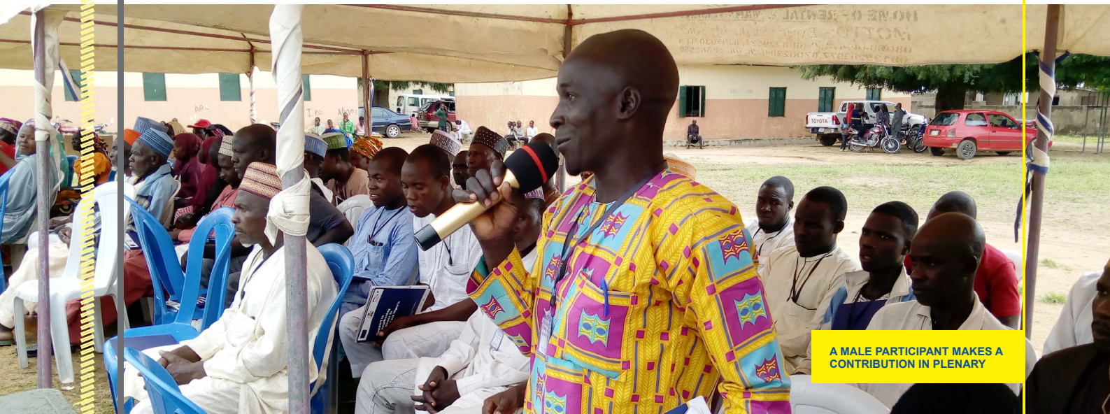
A MALE PARTICIPANT MAKES A CONTRIBUTION IN PLENARY