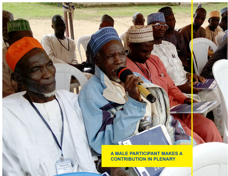
A MALE PARTICIPANT MAKES A CONTRIBUTION IN PLENARY