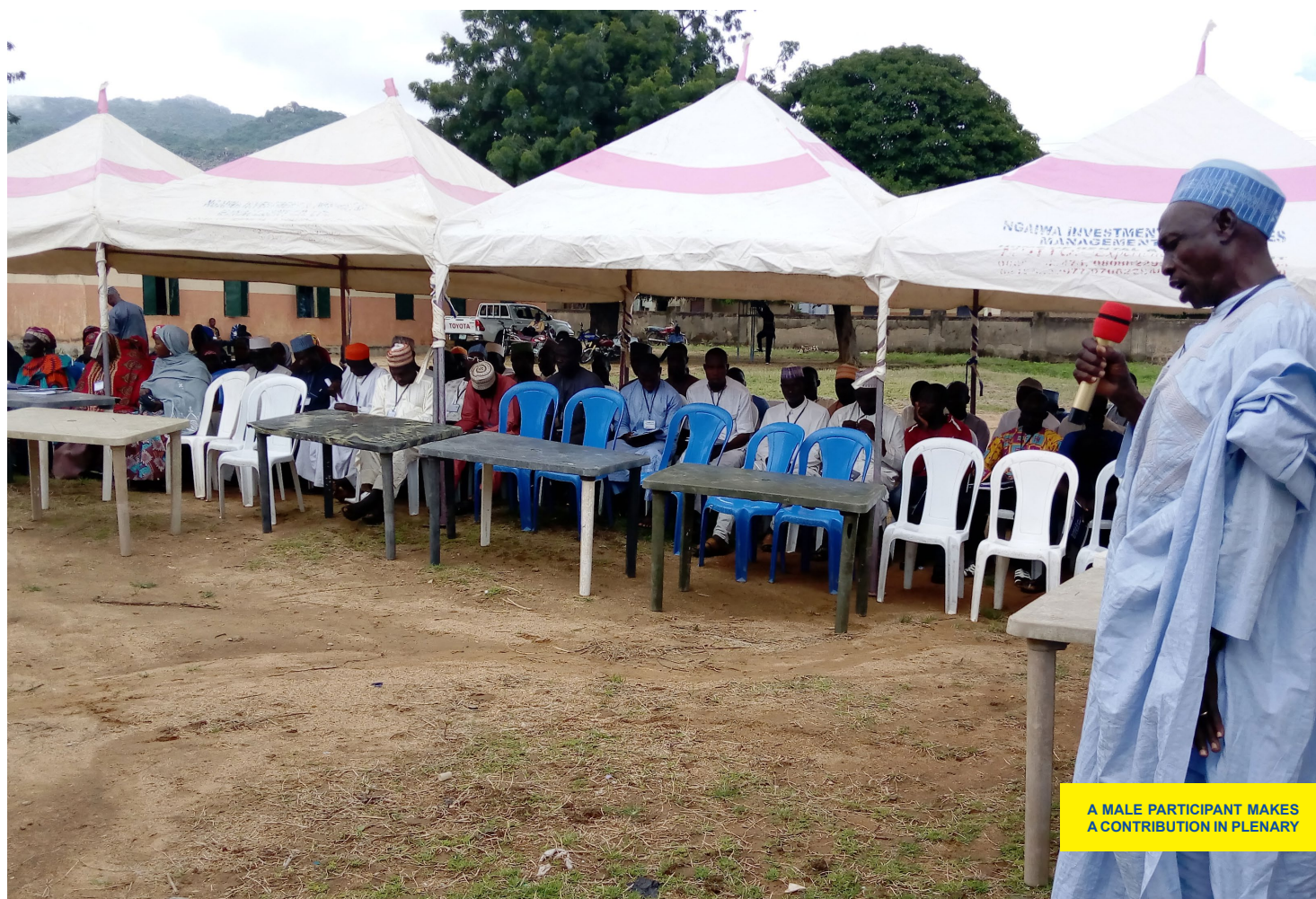
A MALE PARTICIPANT MAKES A CONTRIBUTION IN PLENARY

In the tables below, you will find a summary of our discussions: