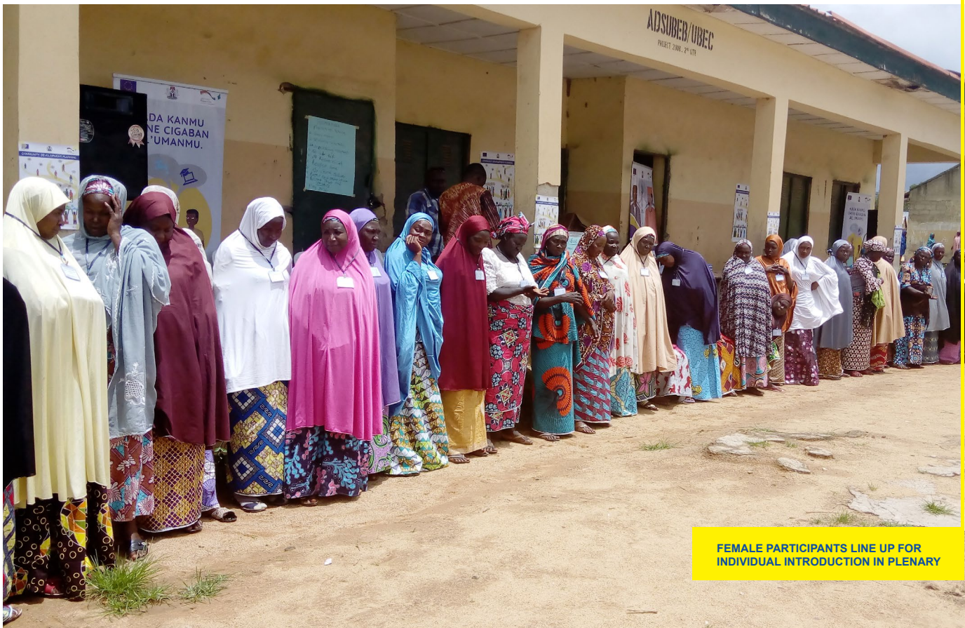
FEMALE PARTICIPANTS LINE UP FOR INDIVIDUAL INTRODUCTION IN PLENARY

Some of the resources that you would find in our communities include Farmland, economic trees, blue safaya, honey, mountains, secondary, primary and Islamic schools, health centres, football fields and places of worship. In the same vein, we face several challenges such as lack of potable pipe-borne water, refuse dump sites, high rate of armed robbery, incidents of kidnapping, drug abuse, inadequate modern farming equipment, lack of good road networks, lack of employment opportunities for youths, inadequate health personnel in our health facilities, insufficient medical equipment, insufficient secondary school teachers, lack of educational materials in public schools, insufficient classrooms, etc. At the end of the sessions, a 26-man follow-up committee was established and tasked with the responsibility of advocating and lobbying for projects on behalf of our communities.