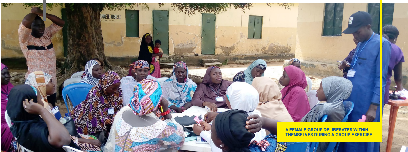
A FEMALE GROUP DELIBERATES WITHIN THEMSELVES DURING A GROUP EXERCISE