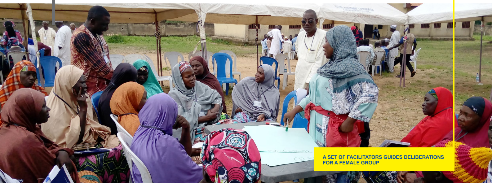
A SET OF FACILITATORS GUIDES DELIBERATIONS FOR A FEMALE GROUP